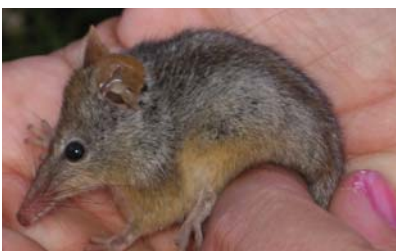
Honey possums are one of the many animals that depend on the nectar and pollen produced by proteaceous rich plant communities.

Proteaceous rich communities are an important component of the vegetation mosaic that exists across the Fitz-Stirling and contain many of the distinctive species that characterise the flora of the south coast region. As well as their diverse forms, they are rich in wildlife and provide many resources for resident as well as visiting animals and invertebrates. Their prolific flowering provides the nectar and pollen for honeyeaters, silvereyes, wood swallows, honey possums, dibblers, native bees, jewel beetles and a wide variety of other invertebrates and birds throughout the year, and particularly during summer and autumn when other sources are scarce. These animals are in turn vital for pollination which ensures the plants' long term survival and keeps the population genetically healthy. The soft sand makes for easy digging for burrowing wildlife such as skinks, native rodents, turtle frogs, spiders and many other invertebrates.