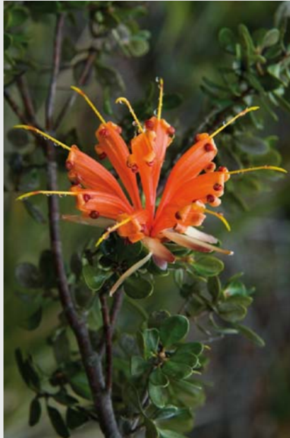
Chittick is one species that occurs in proteaceous rich communities.