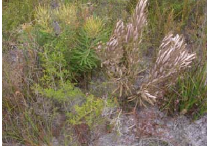
Banksia death through dieback infection.