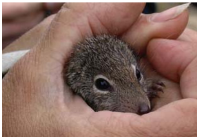
Captive-breed dunnies have been released into proteaceous rich heath in Peniup Nature Reserve.

We are surveying bushland remnants in the Fitz-Stirling to locate and describe the remaining proteaceous rich communities and assess their condition. Bird densities are also being monitored. Proteaceous species are being included wherever possible in our restoration programs. On properties owned by Greening Australia and Bush Heritage Australia, we are mapping and monitoring Phytophthora and taking steps to control its further spread. We are also taking steps to control foxes, cats and rabbits to reduce predation on bird pollinators and other small fauna and to reduce the damage to vegetation.